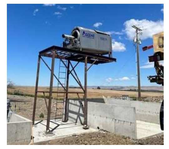
Klingamen manure separator, photo courtesy of Columbia Basin Conservation District

- Dinah Rouleau, Columbia Basin Conservation District Staff