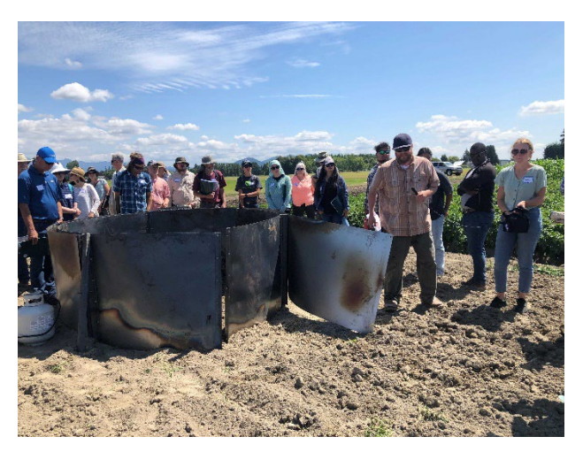
Biochar kiln demonstration at WaSHI SoilCon 2023

Funds from Sustainable Farms and Fields can be used to demonstrate the use of new or innovative climate-smart technologies and/or practices to local producers. In FY23, a collaborative demonstration project led by Skagit Conservation District focused on smallscale biochar production and use.