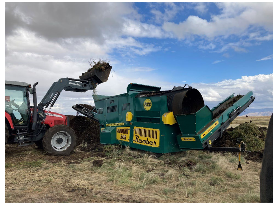
Manure screener at Asotin Conservation District