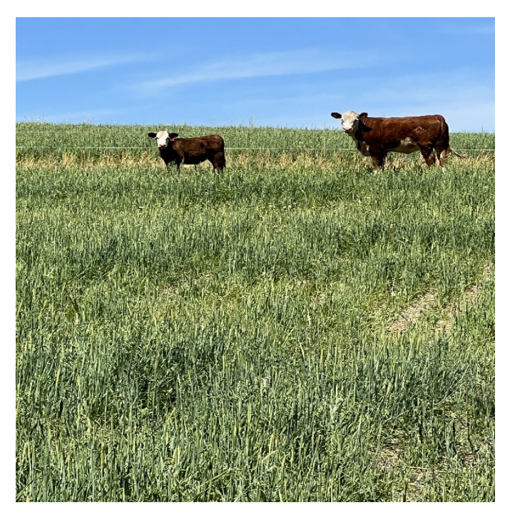
Cover crops being grazed