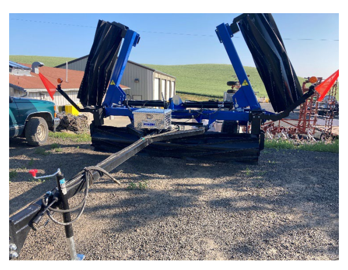
Roll crimper

- Tami Stubbs, Palouse Conservation District Staff